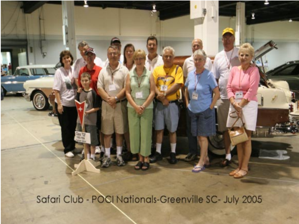
Safari Club - POCI Nationals-Greenville SC- July 2005