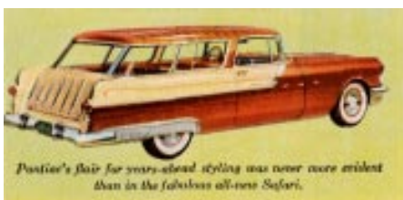
Pony's flair for years-ahead styling was never more evident than in the fabulous all-new Safari.

Hope you enjoy the extra 4 pages in this issue. There were so many photos I wanted to get in and leave big enough to view that I decided to make it happen. In the upcoming issues I'll be putting back in Safari Search parts/cars wanted and parts/cars for sale page.