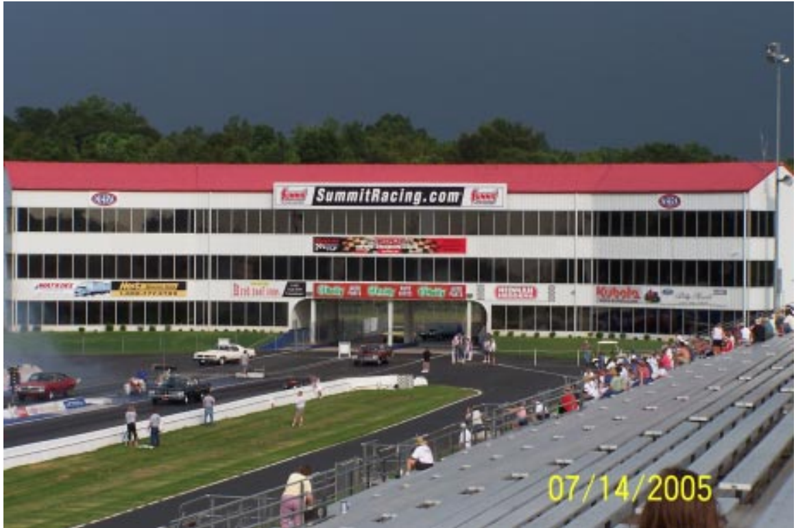
Above: The Atlanta Motor Dragway on Pontiac night, what a blast!!