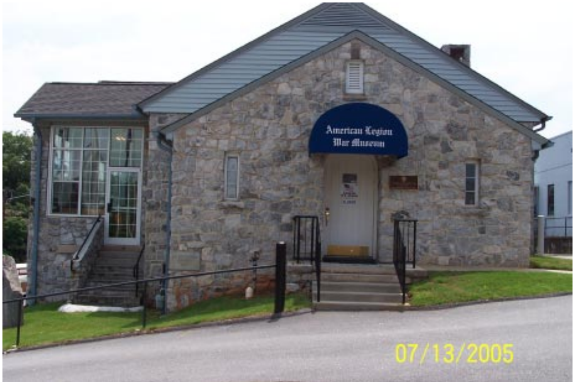
Above: The American Legion War Museum of Greenville, SC, where we visited.