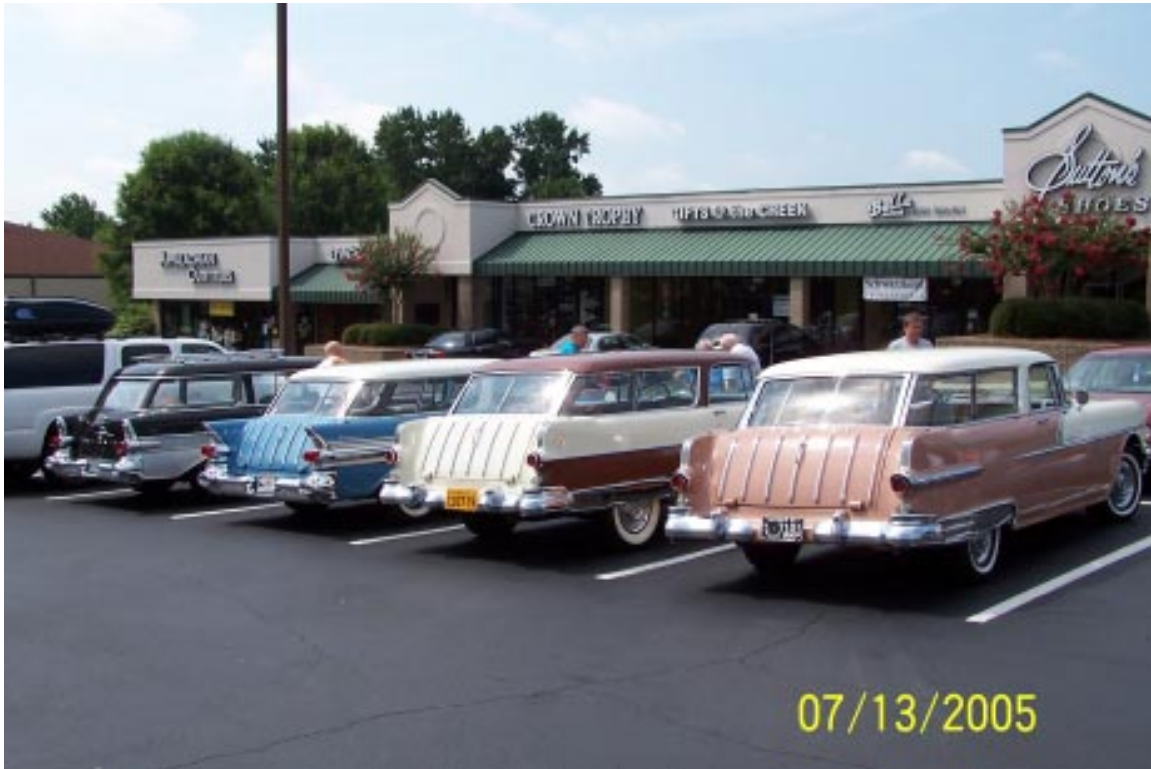
Above: The Four Safaris (White's 57 TC, Evans' 57, Parker's 55, Petry's 56) breaking for breakfast. Below: The Safari gang stops eating for a group picture. The Pye's, Parker's, Evan's, White's, and Petry's attended.